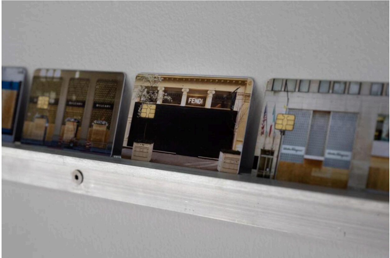
Ignacio Gatica, Stones Above Diamonds (detail), 2023, stock ticker, live financial data, LED screens, steel frame, printed credit cards, card reader, aluminum shelves, 2.5 × 2.5 m.

documented slogans painted on walls in lower Manhattan and splashed across plywood barriers in desolated streets. In Stones Above Diamonds (2020–23), viewers interrupt the stock data that unrolls across a suspended circular display by selecting credit cards that depict scenes arrayed neatly on a nearby metal shelf. Scan the card and a slogan – ‘I STILL WAIT YOU MY FREEDOM,’ reads one – hijacks the feed, resurrecting a trace of those strange months.