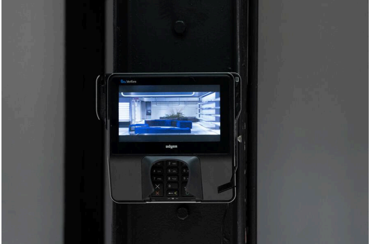
Ignacio Gatica, Fantasmas Terminal , 2023, digital card reader, media console, dimensions variable.

Still, there is a genuine beauty to Gatica's work, an unexpectedly caring transmutation of capitalist realism and its visual culture. Several photographs of derelict shops, such as BALENCIAGA (620 Madison Ave, New York, NY, 10022) (2023), are displayed as traditional stills, framed in engraved-aluminium shadowboxes to elegiac effect: Balenciaga never actually looked this good. My favourite work was Fantasmas Terminal (2023), a small credit-card reader, that ubiquitous financial interface. Resting on the floor, it looked vulnerable, its sad display carouselling through eight minutes' worth of Gatica's street scenes. Good-old-fashioned culture jamming is at work here – abstract forces are brought back to their grubby materiality, revealed as artifice, so much sleight of hand.